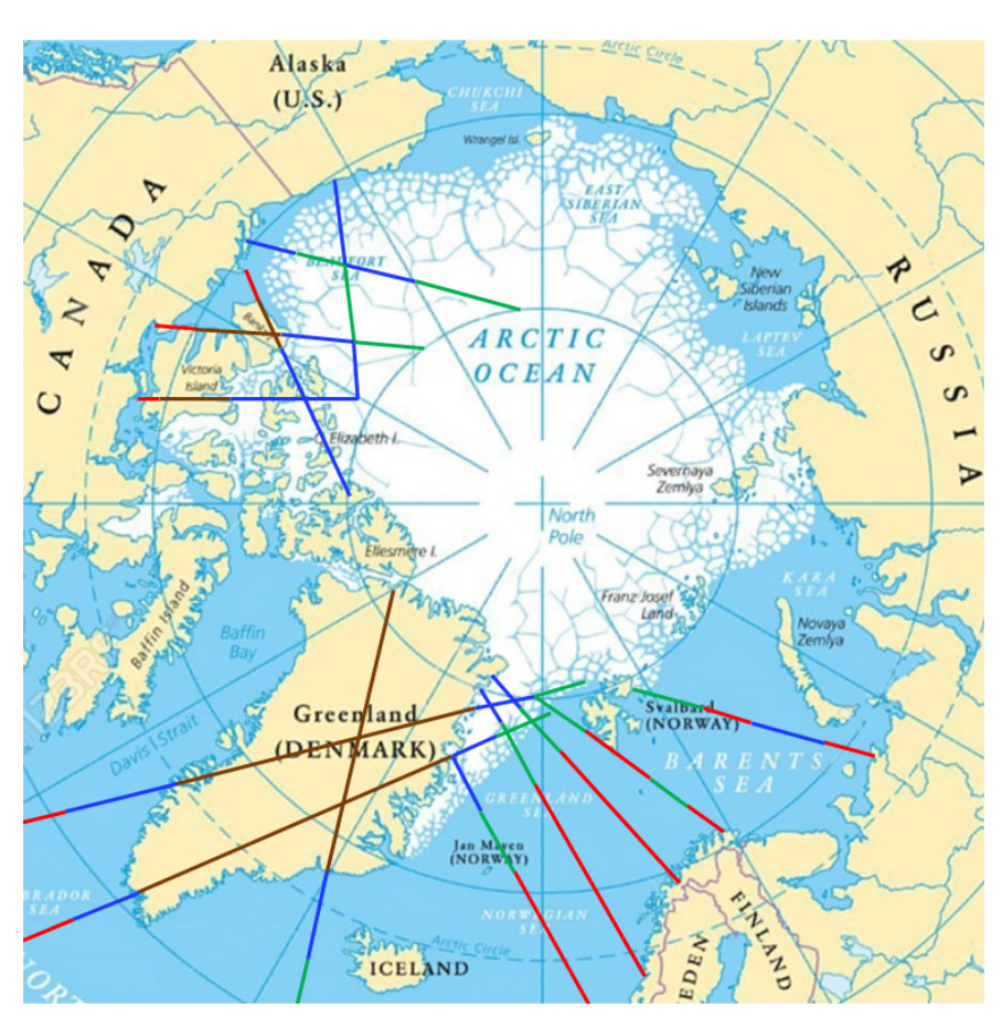
Figure 2. Results of the classification of the Arctic ice field on the base of satellite radiometers data (8–9 February 1984). Ice-free water is shown with red lines; one-year ice is shown with green lines; multi-year ice is shown with blue lines; pack ice is shown with brown lines.