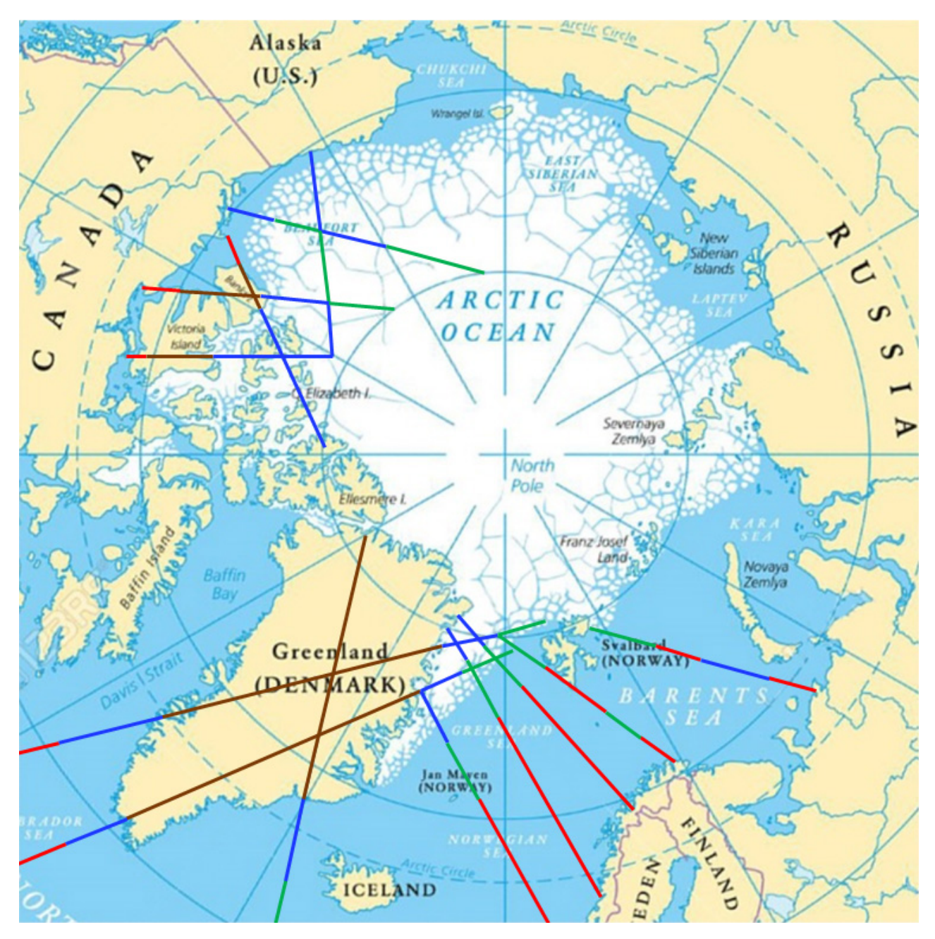
Figure 2. Results of the classification of the Arctic ice field on the base of satellite radiometers data (8–9 February 1984). Ice-free water is shown with red lines; one-year ice is shown with green lines; multi-year ice is shown with blue lines; pack ice is shown with brown lines.