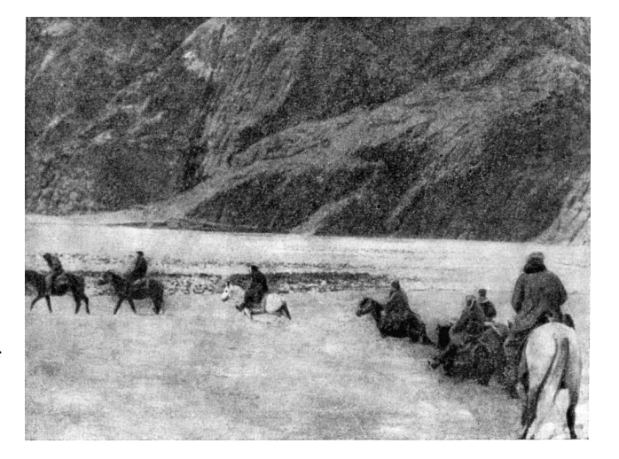
Figure 7. Trekking in to the Fedchenko.

[57] Some also ventured 'in harm's way'. Between 1955 and 1958 a few women scientists and crew members took part in the first two Soviet Antarctic expeditions. In January