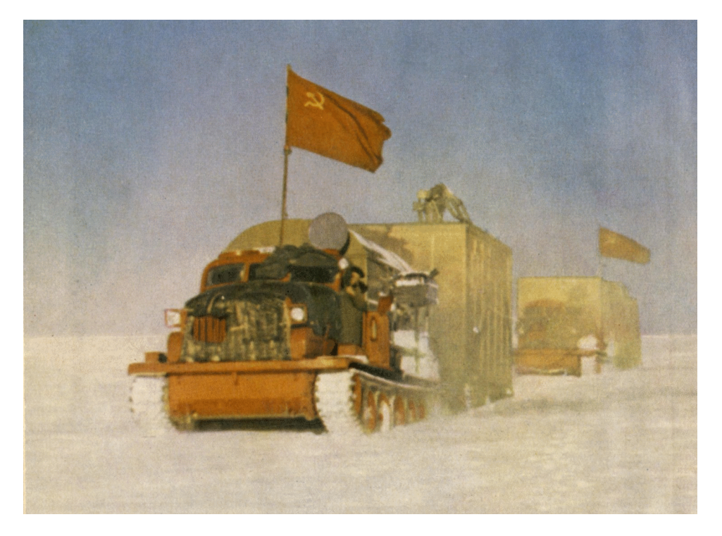
Figure 4. Tractor train.