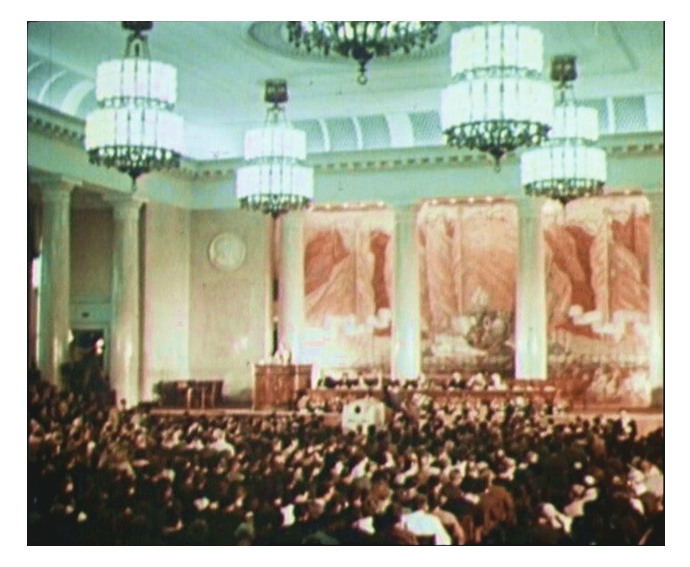
Figure 8. Fifth CSAGI Assembly.

[62] During the IGY there was Soviet disappointment at the limited number of committees, outside the Eastern bloc, which took the optional decision to send their data to Moscow as well as to Western WDCs. There was no obligation on scientists, either, to send copies of their subsequent IGY-related publications to any WDCs at all. The amount of such material reaching WDC-B also fell below expectations. A later report bears out those early concerns.