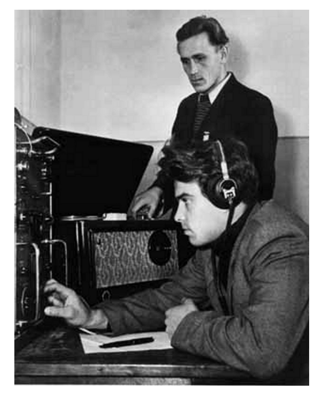
Figure 6. Tracking Sputnik 1 at the Crimean Astrophysical Observatory.

[51] Korolyov did not launch a satellite before the opening of the IGY on 1 July 1957. But another significant date was approaching, 17 September, the centenary of the birth of Tsiolkovskii. In June Belousov brought the longawaited outline of the Soviet IGY rockets and satellites programme to a meeting of the CSAGI committee in Brussels. Western readers found it frustratingly vague. On his copy Richard Porter, the chairman of the US IGY satellites panel,