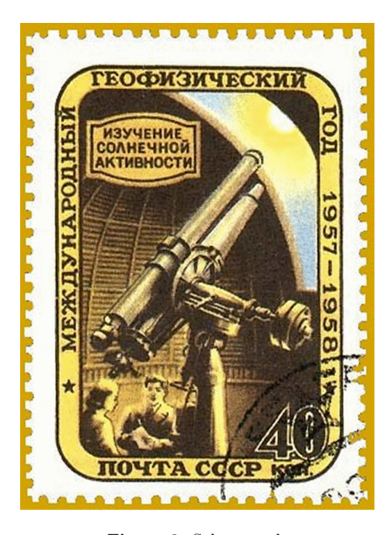
Figure 3. Solar patrol.

[27] The Soviet committee provided the busiest node in the global communications network which underpinned the