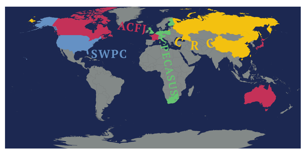
Figure 2 – Map of countries involved in ICAO space weather service.

tion. See Figure 1 for calm weather anomaly distribution. High-frequency communication degradation advisories are issued when specific X-ray flux, planetary geomagnetic index, auroral cap absorption exceeds the defined values. Additionally, the maximum usable frequency dynamics during the post-storm depression of the ionosphere also triggers this advisory. Two-way satellite communication is currently not monitored and is not provided advisories on. This is because both the observation and thresholds are not yet set with regulating documents. There is an ongoing discussion on this topic within the workgroups of ICAO, industry and scientific community. The space weather centre updates the advisories as the situation develops or subsides.