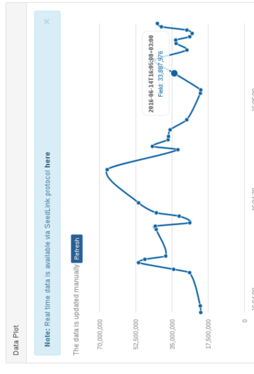
Figure 2. Web user interface is a flexible yet very accessible way to manage the system. The operator can use virtually any web-aware device to set up and monitor the system. Underlying REST API also allows any kind of automated management and monitoring as well as further integration with large-scale software.